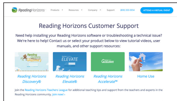
Technical Support on Website

We encourage you to assist your student with any questions he/she has while navigating or using the software (there are help videos that can be accessed by clicking the question mark at the bottom of the software and technical help at www.ReadingHorizons.com/support ). However, we request that you do not read questions or passages or tell your student the answer to items in the assessments and lessons. Simply tell him/her to guess if he/she gets stuck or doesn't know the answer. The assessments and lessons gauge a student's current abilities and respond accordingly. We know you like to help, but be sure the software is finding out what your student knows—not what you know!